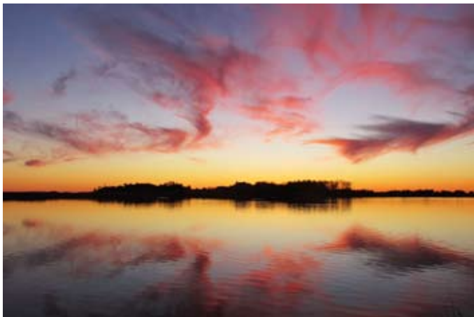
Last wisps of a January sunset over Round Pond, Little Compton