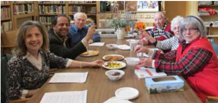
Our Adult Education class takes a moment to say a brachah and enjoy some nuts and fruit on Tu biShevat (Cantor is behind the camera!) The Seder on January 24th was wonderful!

In case you didn't know...the rabbi and can- tor teach an adult ed class every Monday morning in our TBE library from 10:30-12:00. We cover a wide range of topics, from current events to topics in Jewish theology to Jewish history, Rabbinic and Biblical literature, to Jewish music and poetry. The topics change based on the interests of the partici- pants. You do not need to be a traditional Jewish "believer" - all viewpoints are welcome; nor do you need to come to every class in order to get some- thing from any particular class - you can drop in any week. Please join us!